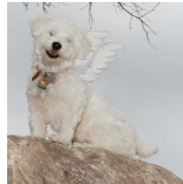
Dusty, the Angel Pups