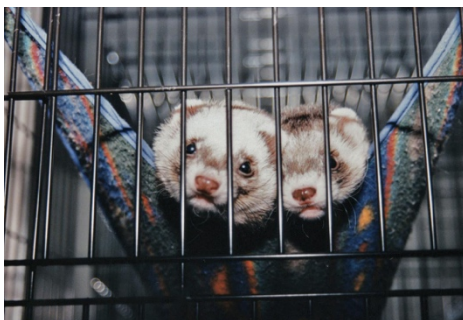
Goodnight, Big Wuzzy