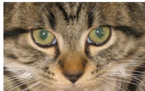
Purrkins, the Cat

Look for an announcement about my books on my web site www.amylpeterson.com .