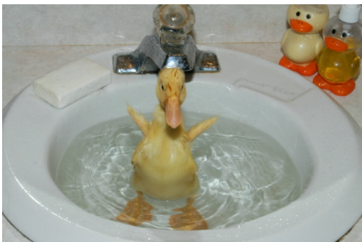
Bumpkin Gets Big

For those who like photos more than words, I've also taken my four kid's critter photo books currently at Bookemon.com and converted them into books that rhyme. These photo, rhyming books will be converted into e-books which will be for sale for 99 cents at Amazon.com. Kids photo books are: